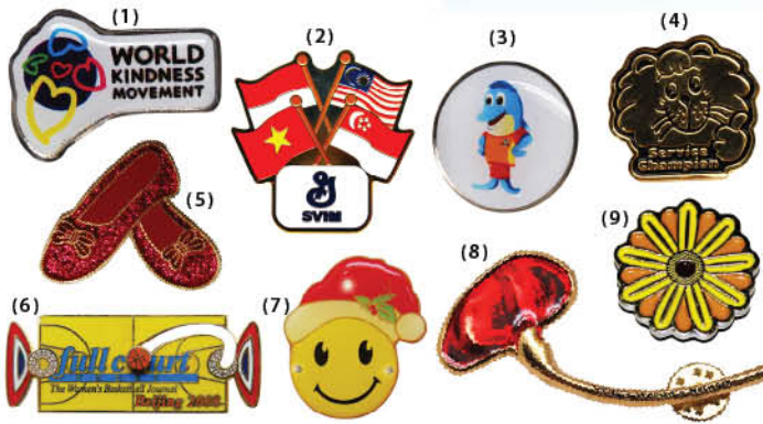
Collar Pin - Printing (1)/ Etching (2)/ Epoxy (3)/ Matt (4)/ Shiny (5)/ Movable (6)/ Light (7)/ Plating (8)/ Stamping (9)

Short production timeline and minimum order is negotiable.