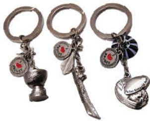
Customised Keychain With Charm