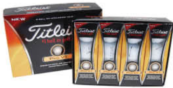
Customised Golf Ball