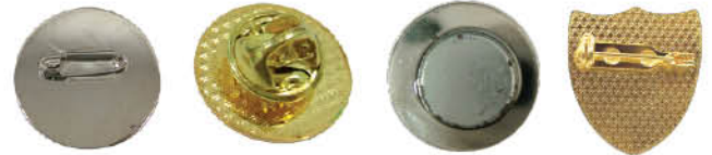
Backing Available: Safety Pin (1)/ Butterfly Clutch (2)/ Magnet (3)/ Lock Pin (4)