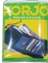
WNP32E-Waist & Neck Pouch