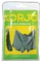
PCL17E-Pegless Clothes Line