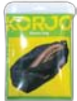
SB15E Shoe Bag