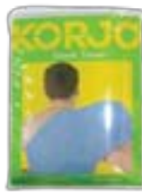
TT69 Travel Towel