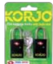
TSALL-TSA Luggage Locks With Indicator