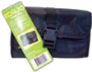
TBO60 Toiletry Bag