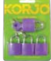
LLC 40-Luggage Lock (4 Packs)