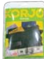
BB41E Belt Bag