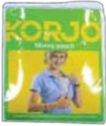
MP65E-Money Pouch (Polycotton)