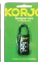
DL 24-Designer Lock