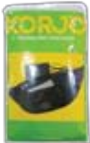
TP13 Travel Pouch