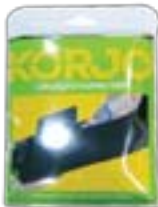
UB39-Ultralight Money Belt