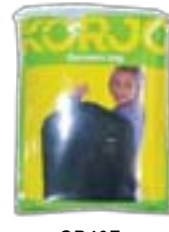
GB43E Garment Bag