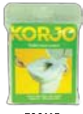
TSC09E Toilet Seat Cover