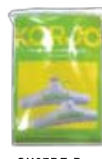
CH37DE-Duo Pack Coat Hanger