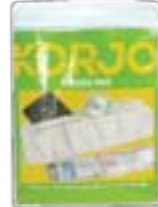
MB64E-Money Belt (Polycotton)