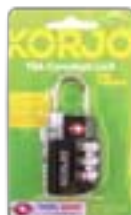
TSA 72-TSA Compliant Indicator Lock