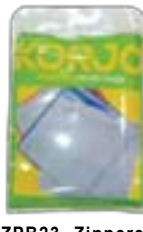
ZPB23- Zippered Plastic Bag