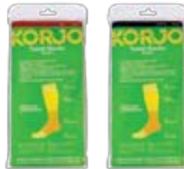
Travel Socks (Size: Small and Medium)