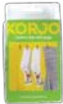
CLP27-Clothes Line With Pegs