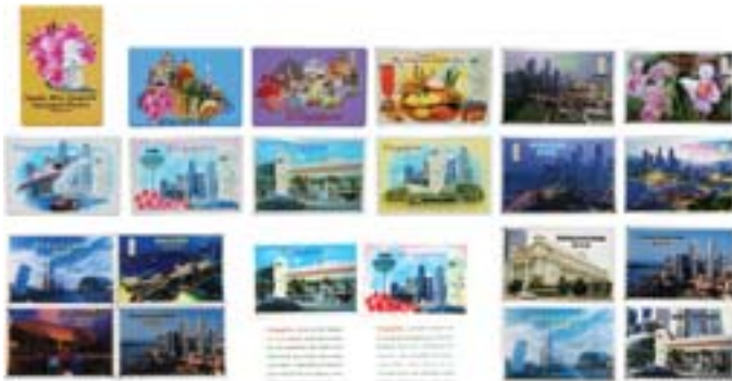
(4 in 1 Pack) Postcard With 2 Magnet